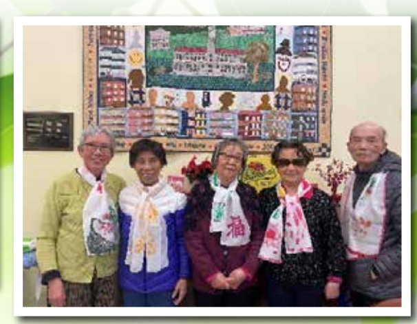
Silk Scarf Making with Webster Home Care